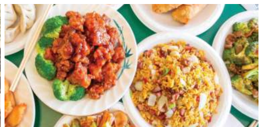
@ Chinese Food