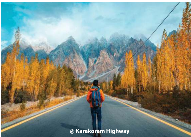
@ Karakoram Highway