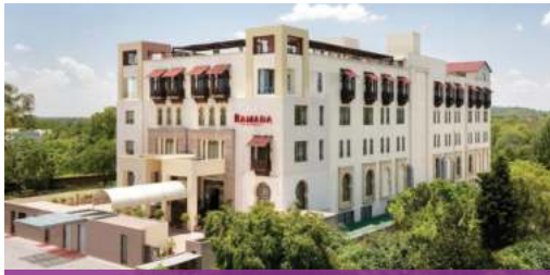
(Islamabad) Hotel Islamabad Ramada