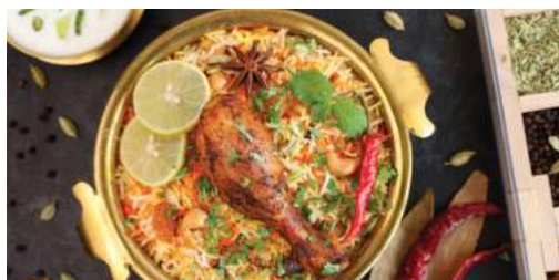
@ Pakistan Food