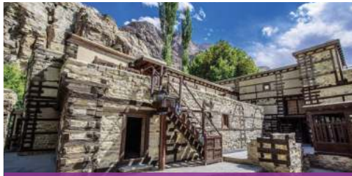
(Skardu) Skardu Serena Shigar Fort