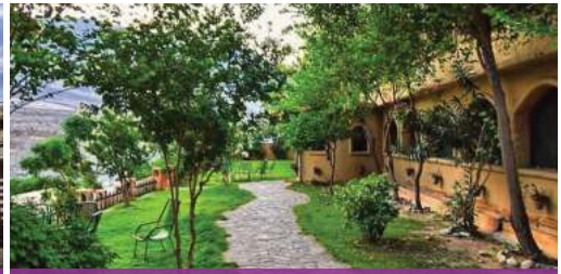
(Chilas) Shangri La Chilas