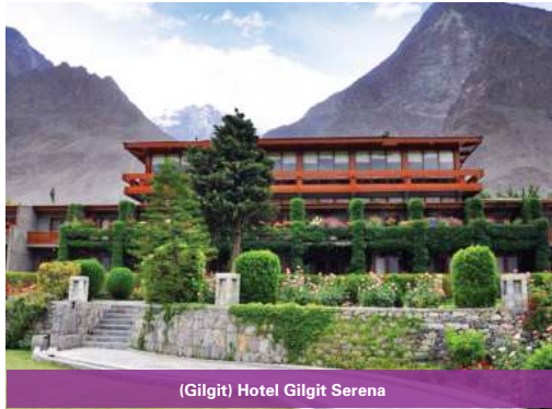
(Gilgit) Hotel Gilgit Serena