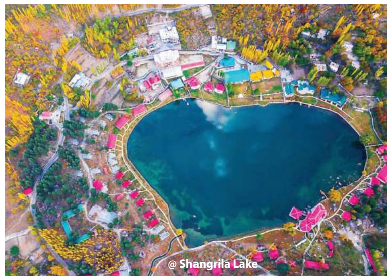
@ Shangrila Lake