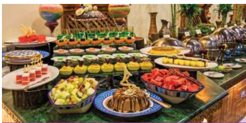
@ Gilgit Serena Hotel Buffet